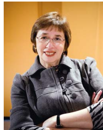
Keynote Speaker Dr. Linda Greenhouse