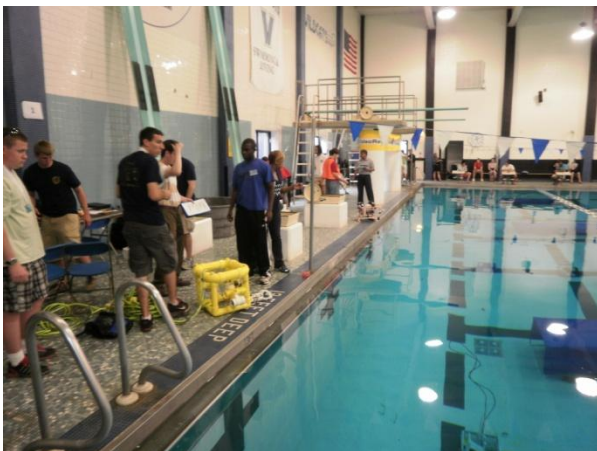
Team Control Stations