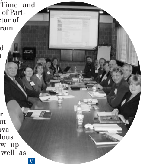
Attendees participate in the first PTS Community College Day.

As a result of this important first step, our visitors departed feeling very positive about the BIS degree, Part-Time Studies and Villanova University. The program was a tremendous success and PTS definitely plans to follow up with future Community College Days as well as continuing this exciting momentum. V