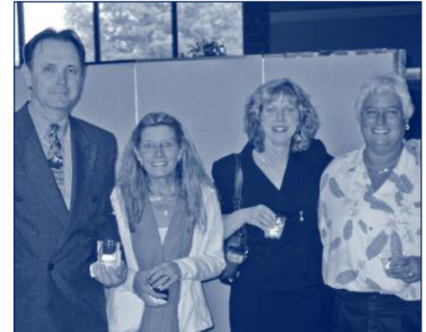
2006 ASL inductees and guests enjoy social hour before dinner.