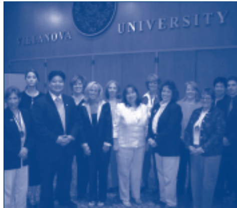
2005 ASL Inductees

Mu Chapter, the Villanova University Chapter of Alpha Sigma Lambda National Honor Society, was installed at Villanova on February 6, 1958. This year's May 5th annual awards dinner and induction ceremony will mark the forty-eighth anniversary of that installation. To be considered eligible, Villanova students must be in the top 10% of their class, have completed 24 Villanova credits and have earned a minimum 3.2 grade point average.