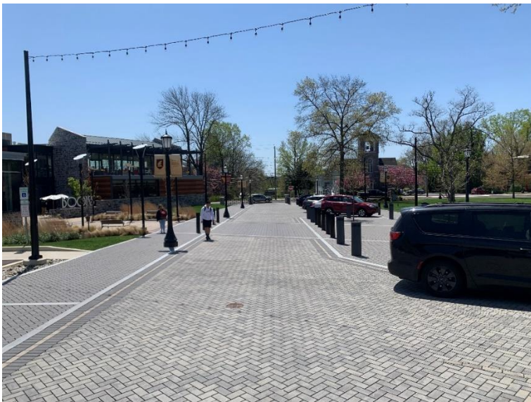
Figure 2. Permeable Pavers at Ursinus College

The multi-purpose pavement is an example of a successful green infrastructure project that is operating as designed. The use of permeable interlocking concrete pavement has provided multiple benefits including: a stormwater control measure that is reducing surface runoff; infiltrating rainwater into the subgrade, providing volume retention; and functioning as a highly aesthetic structural pavement surface, all in one system (Figure 2).