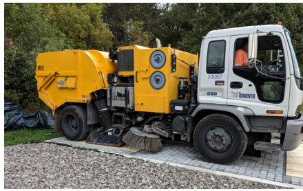
Regenerative Air Machine