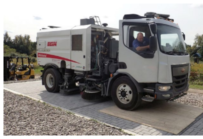
True Vac Machine