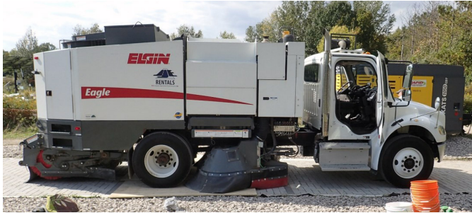
Waterless Mechanical Sweeper