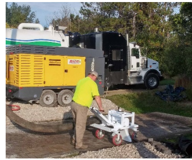
High Pressure Air and Vacuum System

infiltration. Measurements ranged from 50 in./hr to 547 in./hr. Power washing and a Shop Vac improved surface infiltration by 25%. The waterless mechanical street sweeper restored the PICP's surface infiltration capacity to 35% of its original condition, or about 139 in./hr. The high pressurized-air and vacuum system fully restored the PICP to its baseline, post-construction surface infiltration. Average surface infiltration rates were 2 to 6 times higher than from other equipment, ~508 in./hr for cohesionless soil mixed with jointing stone.