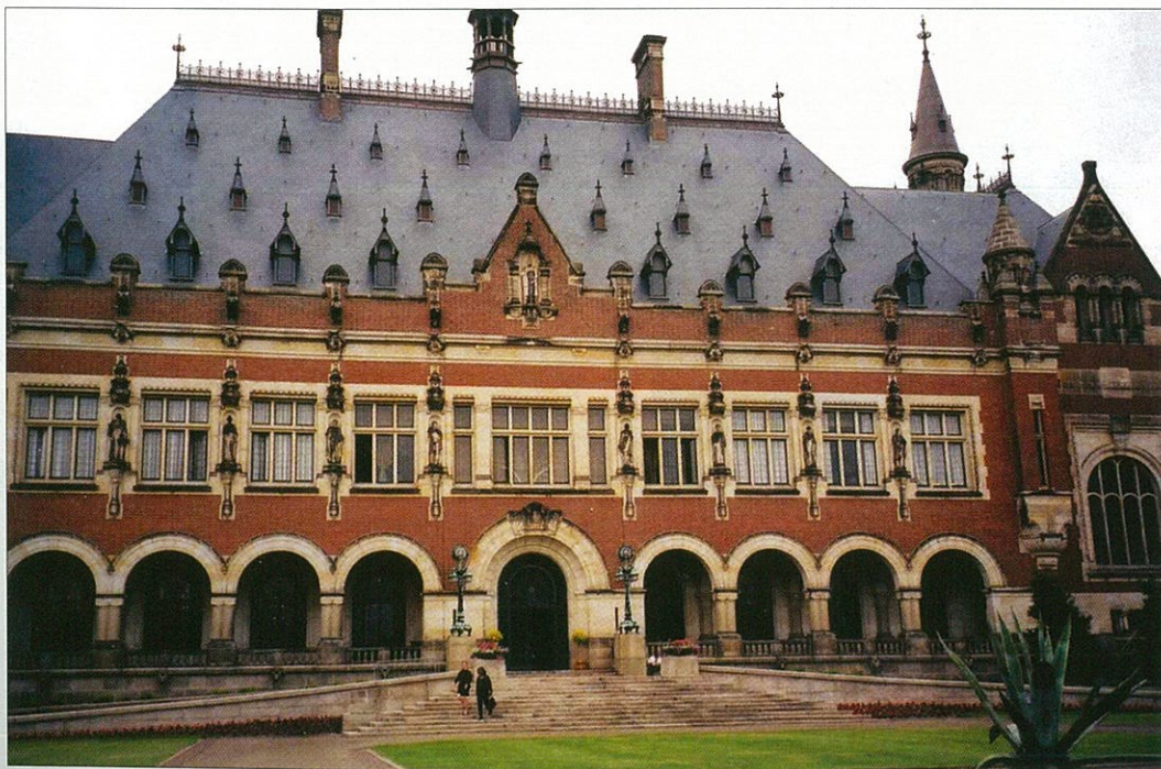
The Peace Palace in The Hague held the 2003 swearing-in of the ICC's first chief prosecutor.

Gender balance remains an ongoing issue of importance with coalition members. We always remind the prosecutor and registrar of the need to hire more female staff, particularly at the highest lev-